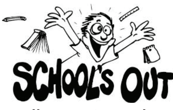
Have a great summer! See you again in August!

In the 2023-2024 school year we introduced 21 NEW MATCHES! 21 kids getting an extra caring adult in their life is something to celebrate! Introducing new matches is one of my favorite parts